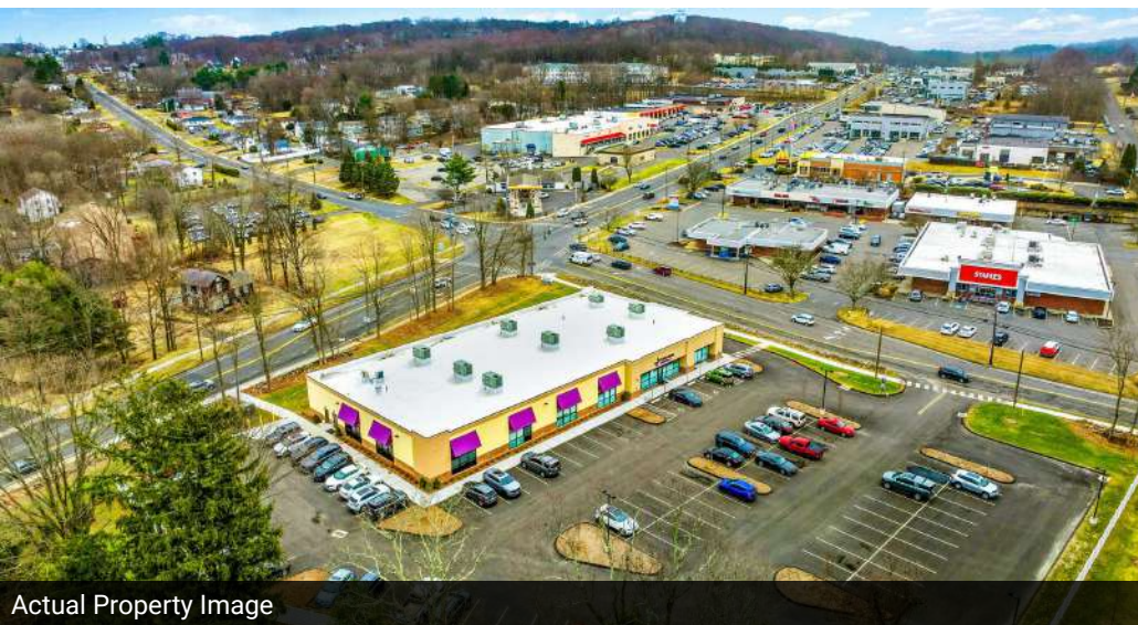
Actual Property Image