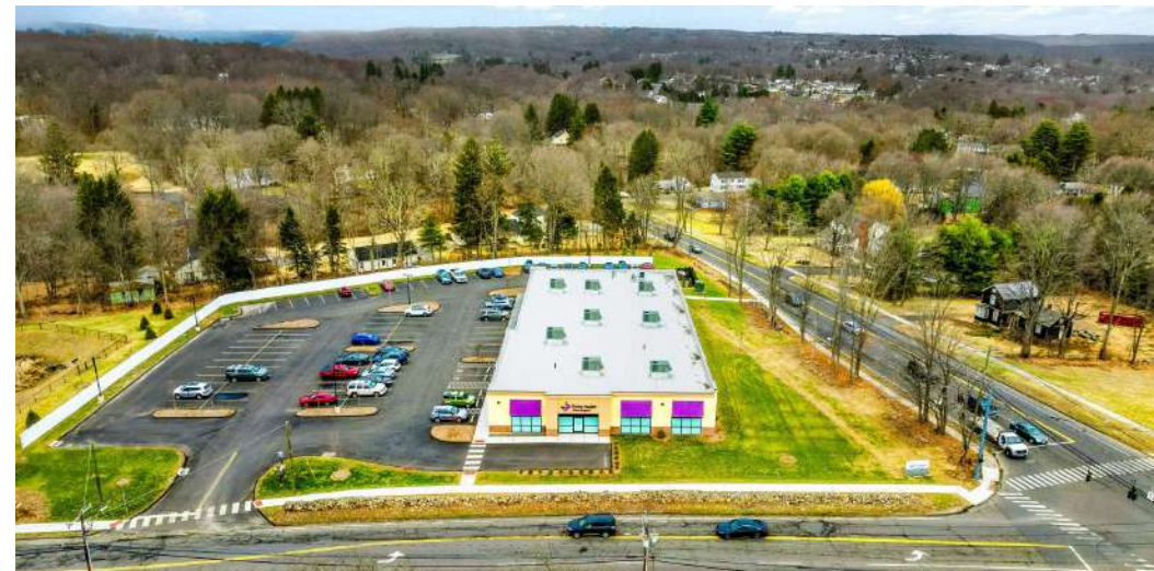
Actual Property Image