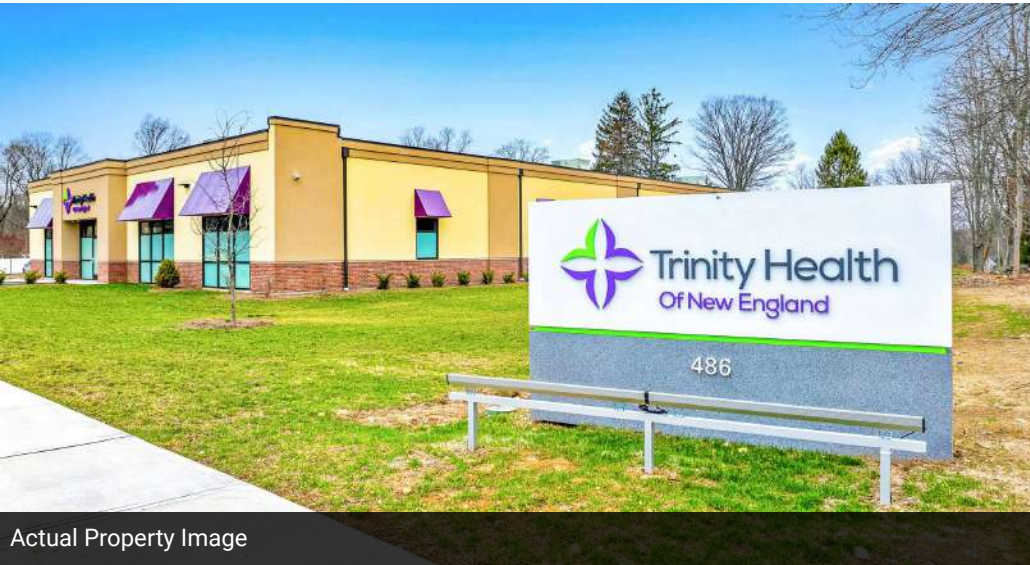
Actual Property Image