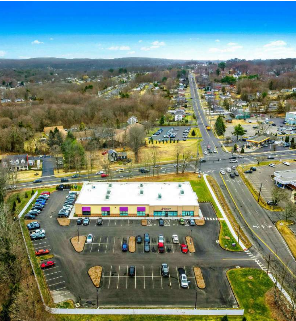
Actual Property Image